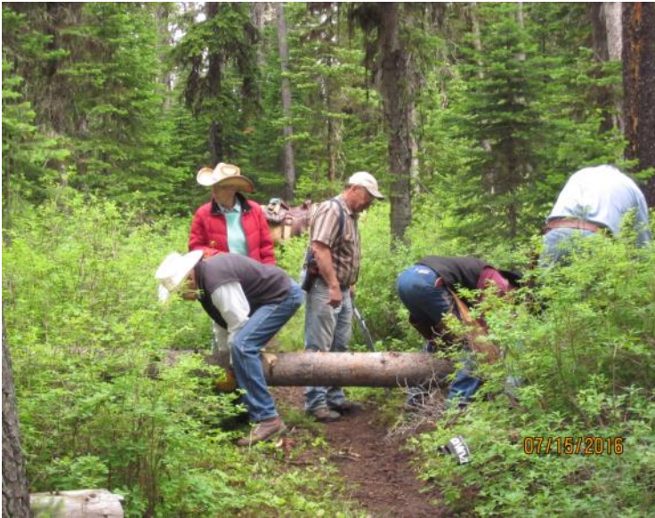
Green Gulch Work Project (Clearing a downed log)