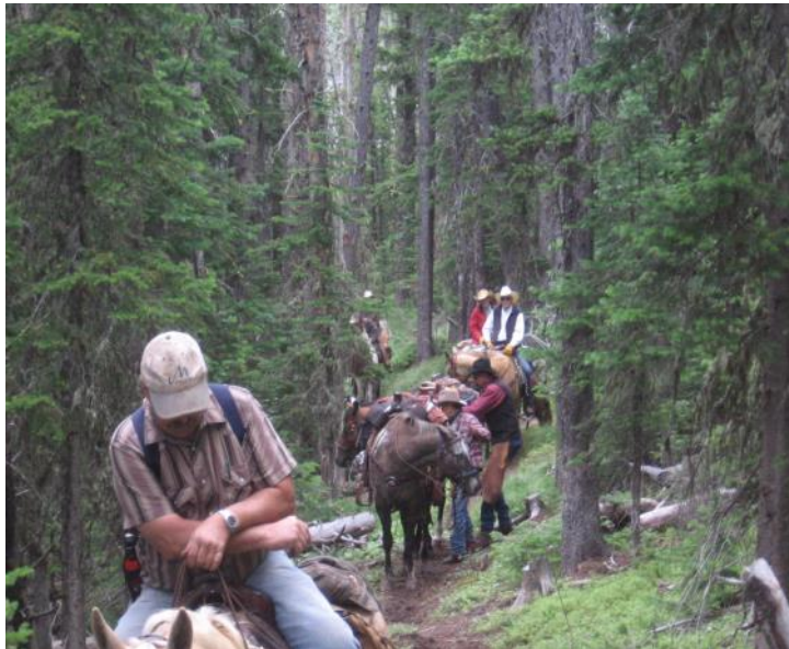
Stopping for an equipment adjustment