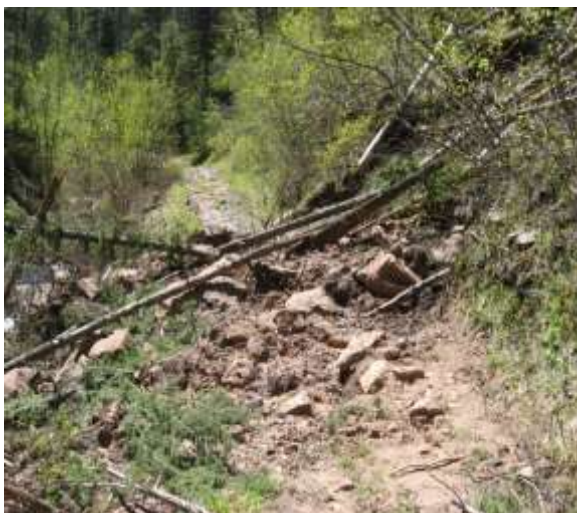
Trail closed somewhere