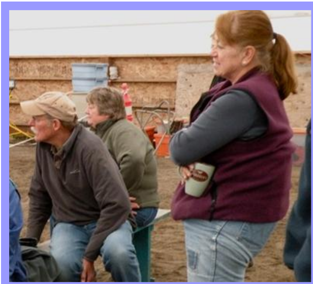
Watching the other riders as they ride around the arena