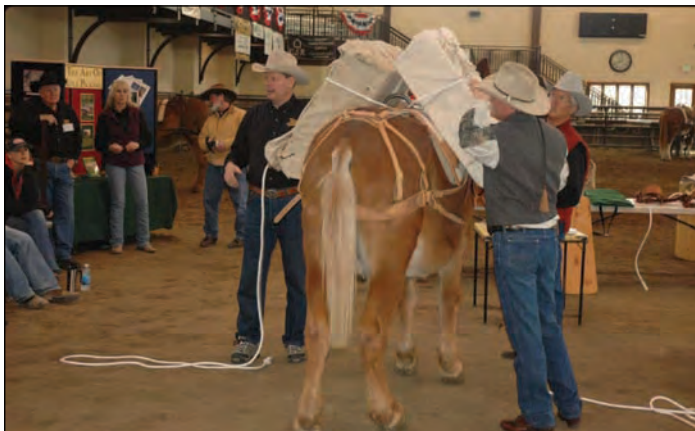
Balancing the Load