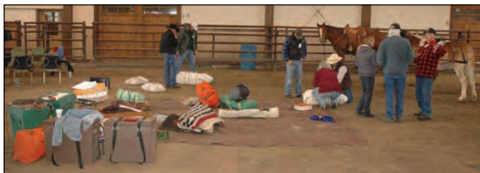
Learning to Pack