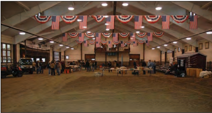
Copper Springs Arena

Editor’s Note: “Horsing Around” is a new feature for our newsletter. We will include stories about or from our members as interest and space allow. Please share your story or news.