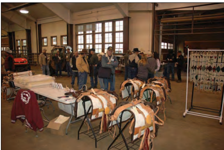
MT Horseman Saddle Building School Display