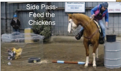
Side Pass- Feed the Chickens