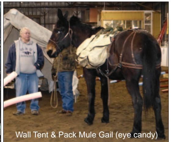
Wall Tent & Pack Mule Gail (eye candy)