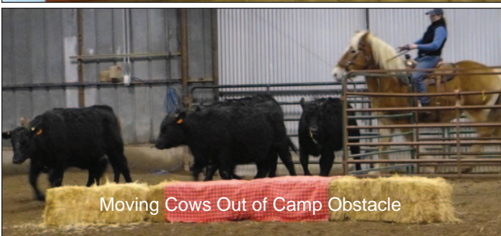
Moving Cows Out of Camp Obstacle