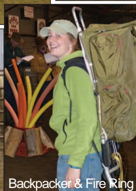
Backpacker & Fire Ring