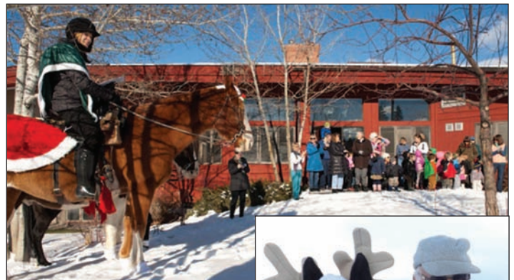
at the Senior Center