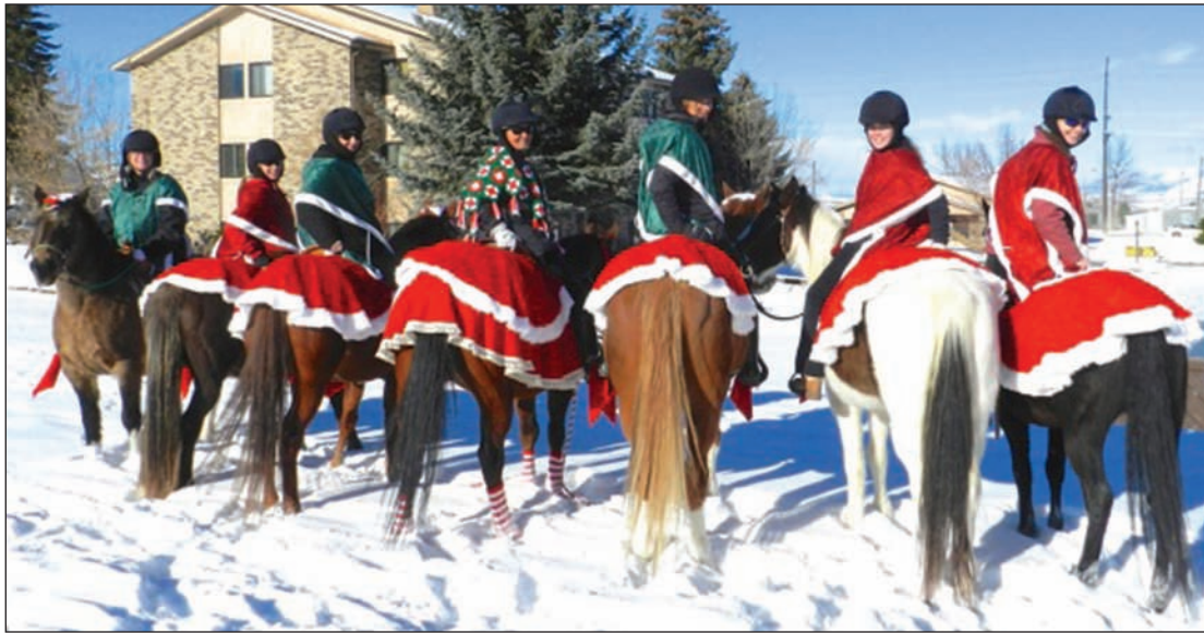
The (Horse) Rockettes?