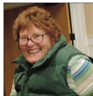
Call Beth Merrick if you are interested in a First Aid/CPR class