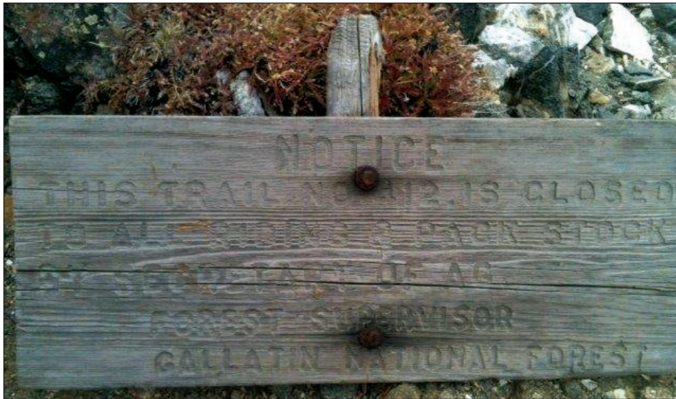
This sign was on the ground at the divide where the trail dropped over in to the Spanish Lakes. Larry said it was from the days when outfitters had overgrazed the area around the lakes while taking dudes and hunters in to fish and hunt. It prohibits all stock, There was also a sign that said the trail was not recommended for livestock.