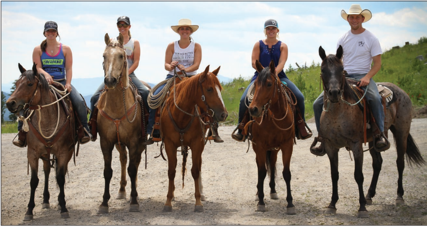
SEE MORE PHOTOS BY DEE DEE TRONSON NAAB