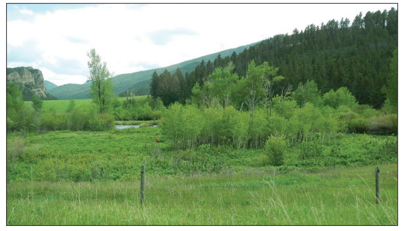
Can you see the bear?

The Falls Creek crew ran across a Forest Service crew. The bridges are in bad need of repair and we put some rocks in one bad bridge to warn horse users to go through the creek. The bridges will be a project for the future. The crews met up and tried to get to the Mirror Y but it started raining on us and we had had enough fun for one day so after 4.5 miles we turned around and headed back to the trailers.