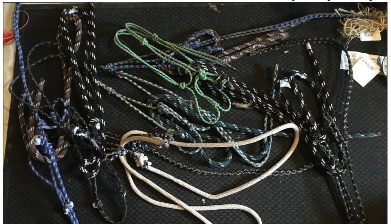
The first time that I had to bring halters inside because they were too frozen to use!