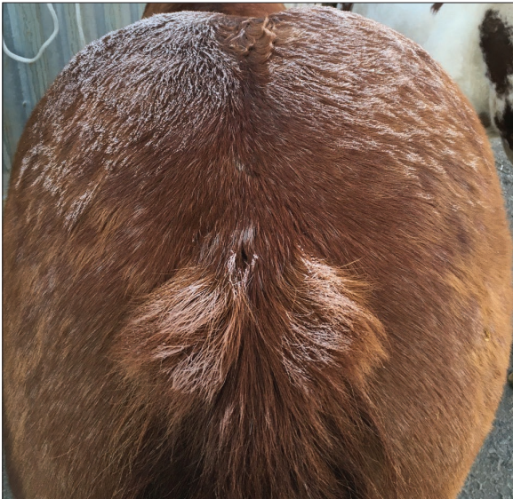
Does this FROST make my butt look big?