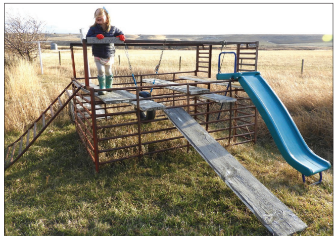
When your play yard is a converted "STOCK" yard - reuse, repurpose, rethink!