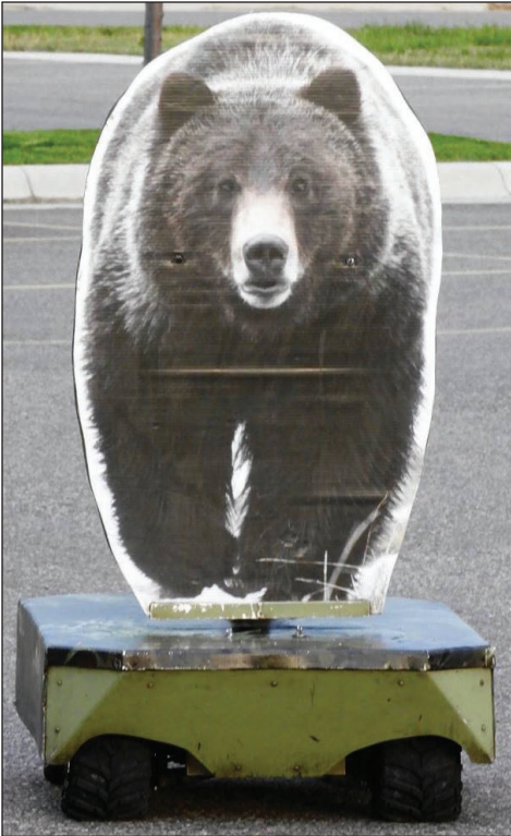
Danielle Oyler presented the Bear Attack program