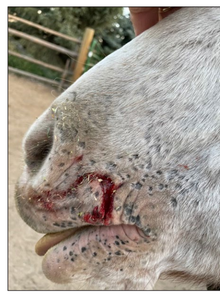
This looked nasty but healed up just fine with a few apps of vetricin gel—DP

—Respectfully submitted by Laurie Connelly