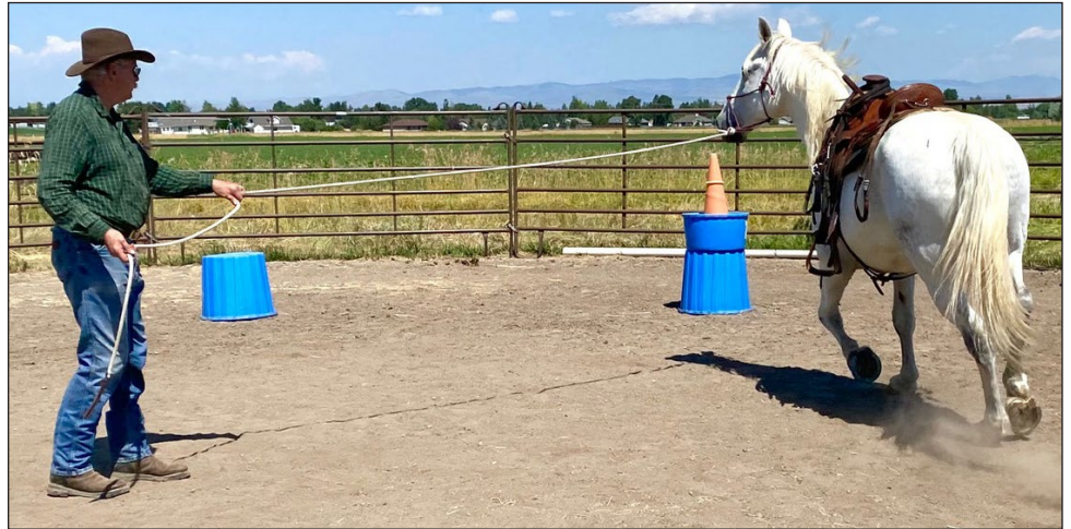
Dan and Cecil doing ground work.