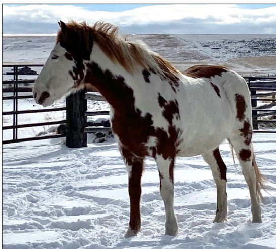
Janice Cartwright horse photos