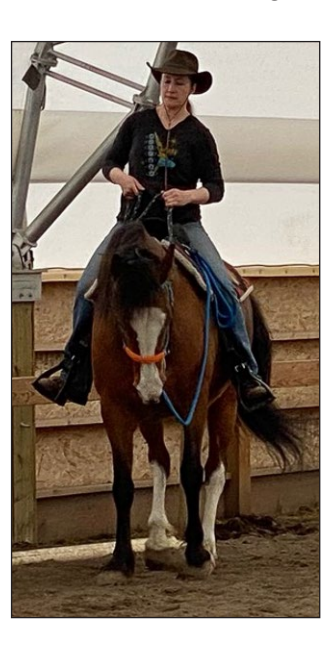
New GVBCH members in "action" with their mounts