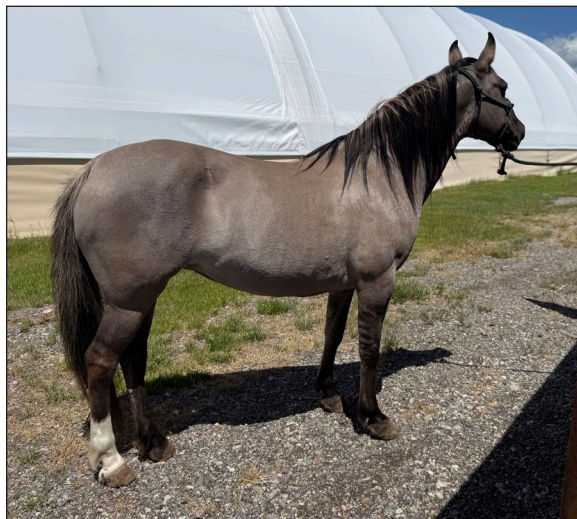
New members, Breuklyn and Lua, passed their trail safety check with a few "tips" thrown in.