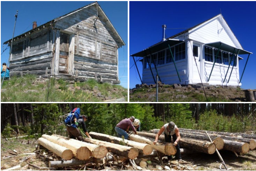
Pic 1: Big Hole Lookout before restoration (2005).