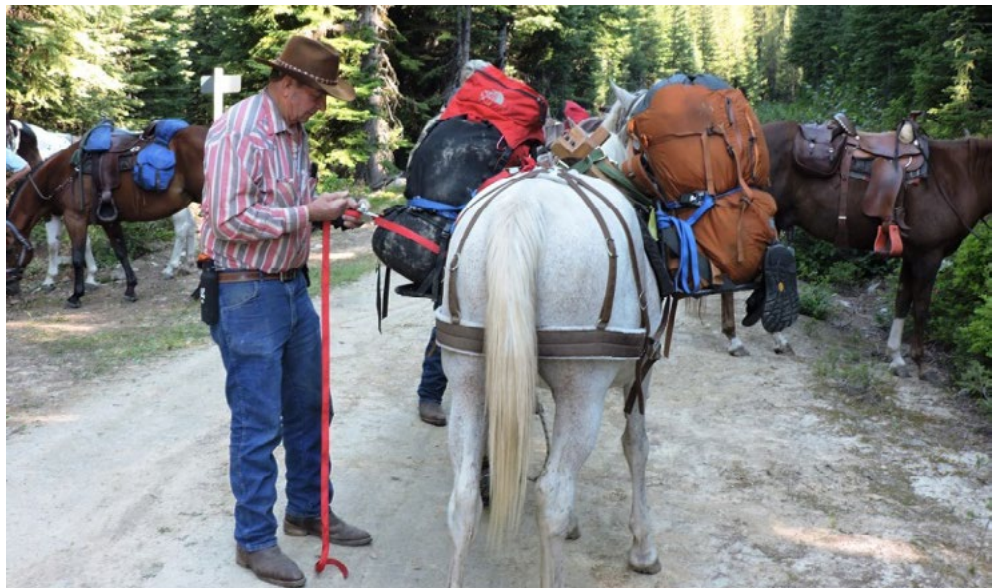
Cabinet Back Country Horsemen packing support.