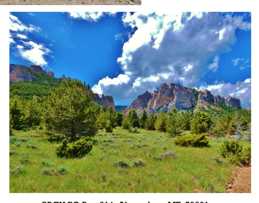
BBCH PO Box 614, Absarokee, MT 59001