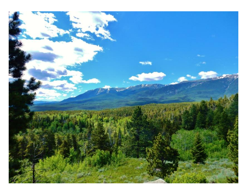
BBCH PO Box 614, Absarokee, MT 59001