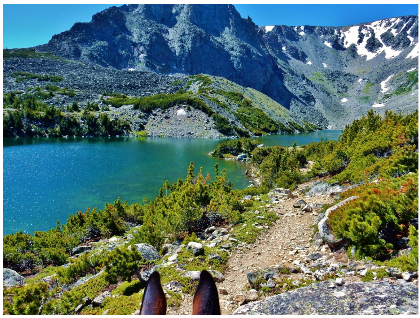
July 11, 2020: Spread Creek Trail