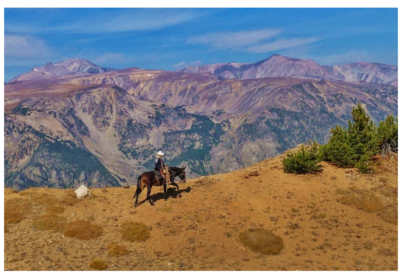
September 23, 2020: Phantom Creek