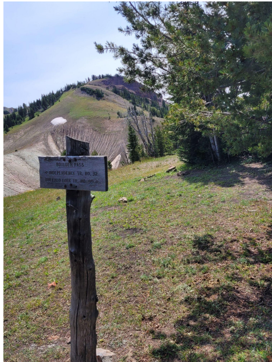
BBCH PO Box 614, Absarokee, MT 59001

The club packed in five MT FWP fish biologists for stream flow surveys on Monday, Aug 14. The project was initially a fish kill in this area to minimize the rainbows downstream in the Park, but that is being held up. This was mostly stream flow surveys.