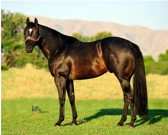
The Goodbye Lane