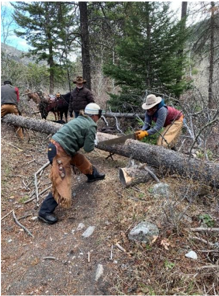
Main Stillwater, ~2023

KEEP TRACK OF THOSE MILES AND SUBMIT THEM! It allows us to justify to the USFS needed maintenance of our equine accessible trails. Call it leverage if you want!