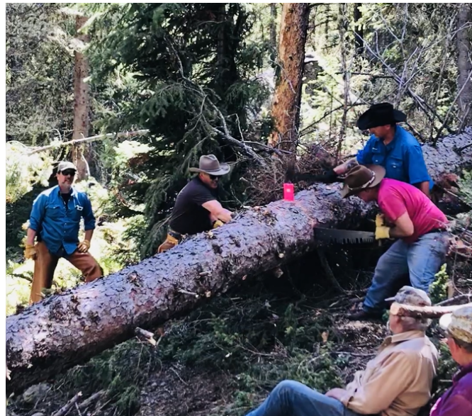
W Fk Stillwater ~2018