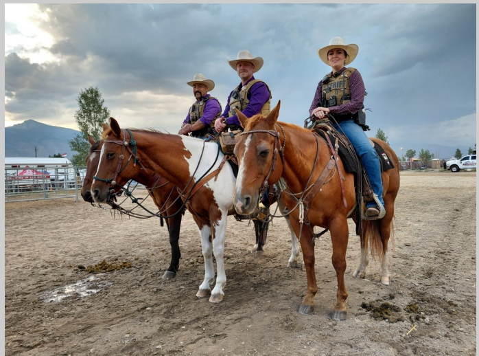
Ravalli Sheriff's Posse during the Fair!

https://bchmt.org/wp/bitterroot/check-your-training/