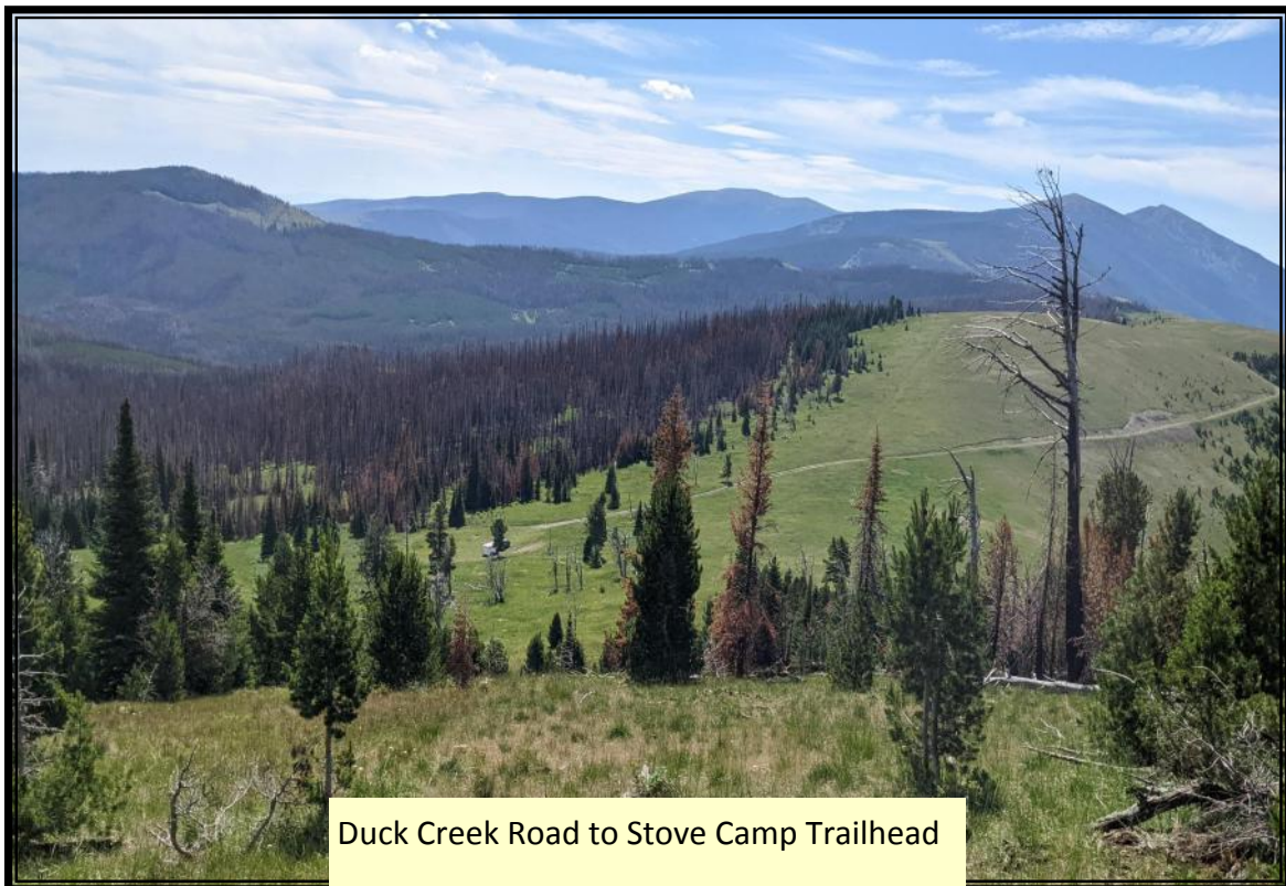
Duck Creek Road to Stove Camp Trailhead