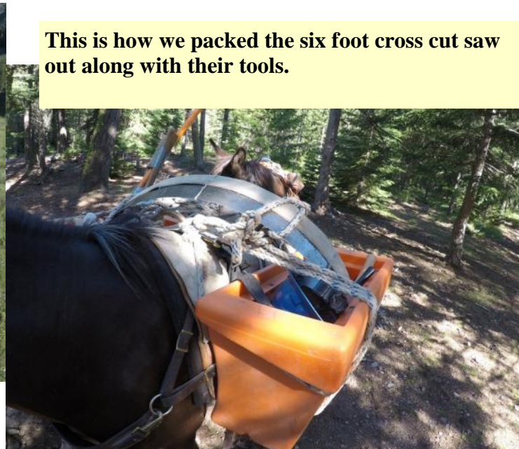
This is how we packed the six foot cross cut saw out along with their tools.