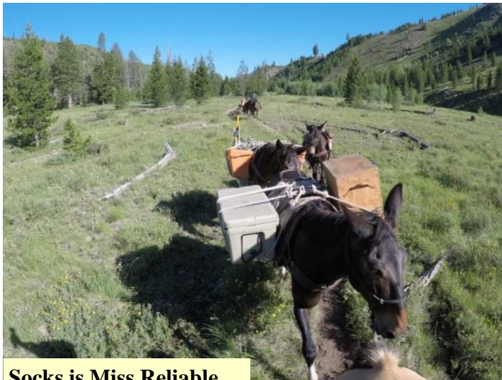
Socks is Miss Reliable.

When we arrived at the BMWF camp, the crew was out working. We used the time to unsaddle the animals, put up electric fence around very little grass and put our tents up. Lauren, crew leader made supper, which was very good. We needed to build a small fire to make coffee; they ran out of gas for the stove. As we gathered our animals, saddled them as some of the crew finished a quick breakfast and started walking out. A couple of the BMWF trail crew stayed around as we finished packing, they left to walk out and Terry, Sherri and I loaded the animals for the trip out. A couple of the loads were odd or appeared to be, kitchen box and cooler. Terry followed for a while, just to help watch the load. Terry, Sherri and I did a good job balancing all the loads.