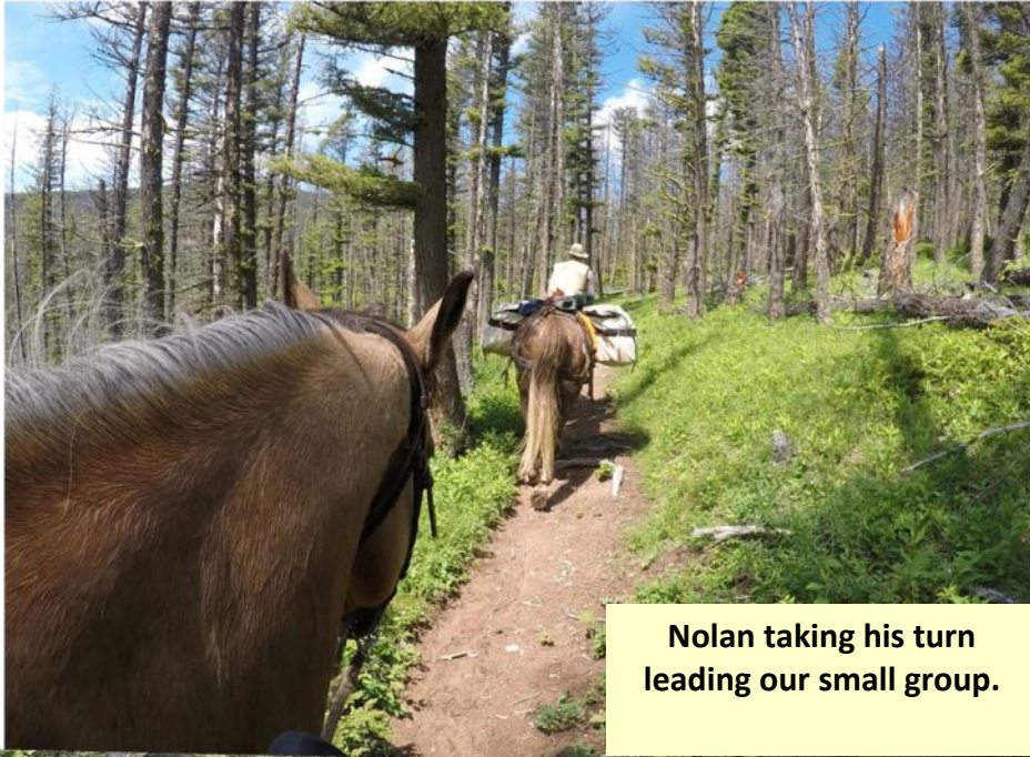
Nolan taking his turn leading our small group.

One wrong turn caused us to catch up to a couple FS packers and ride past a FS trail crew. They put us on the right track. We added an extra mile or two to the trip and saw some country we probably would not have seen otherwise.