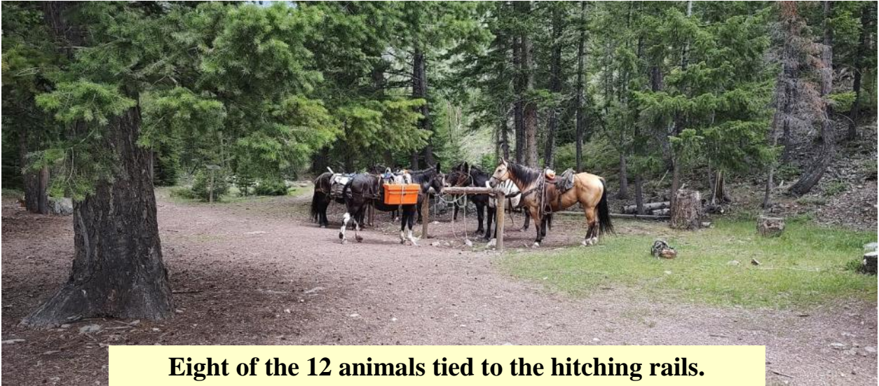
Eight of the 12 animals tied to the hitching rails.

When we arrived at the BMWF camp, the crew was out working. We used the time to unsaddle the animals, put up electric fence around very little grass and put our tents up. Lauren, crew leader made supper, which was very good. We needed to build a small fire to make coffee; they ran out of gas for the stove. As we gathered our animals, saddled them as some of the crew finished a quick breakfast and started walking out. A couple of the BMWF trail crew stayed around as we finished packing, they left to walk out and Terry, Sherri and I loaded the animals for the trip out. A couple of the loads were odd or appeared to be, kitchen box and cooler. Terry followed for a while, just to help watch the load. Terry, Sherri and I did a good job balancing all the loads.