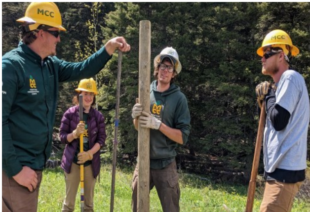
MCC CREWS AT AUGUSTA INSTALLING SIGNS FOR FOREST SERVICE

As you can see this requires pre-planning and commitment from a lot of members. The August meeting will go over the details and make sure we have enough members to complete the project.