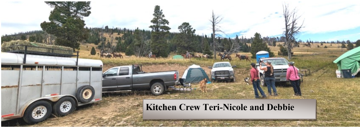
Kitchen Crew Teri-Nicole and Debbie