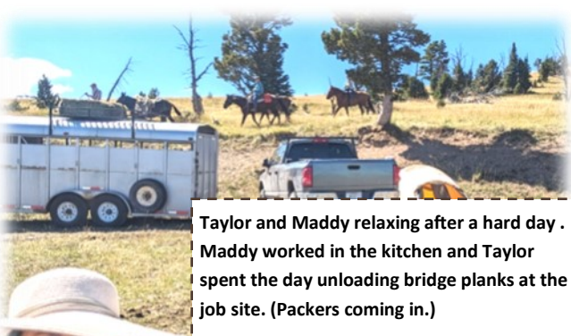
Taylor and Maddy relaxing after a hard day . Maddy worked in the kitchen and Taylor spent the day unloading bridge planks at the job site. (Packers coming in.)