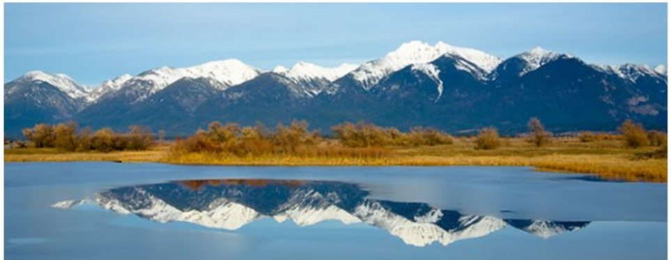
The Mission Mountains

First, what are “Public Lands” ? These are the lands that are owned “equally” by all Americans. There are 618 million acres of public land across the U.S., with a significant portion in Alaska and the western U.S. The total U.S. land base is 2.27 billion acres in size. These federal public lands are managed in trust for us, (citizens of the U.S.) by the Forest Service, Bureau of Land Management, Park Service and the Wildlife Refuge System for current and future generations.