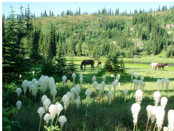
Horses grazing at Mud Lake.

The hike to Upper Cedar Log Lake was short but steep. We found an abundance of flowers, frogs and fish. On a day ride on the State Line Trail, my young mule turned twice on a cliff edge to study the terrain; something that I have never seen a horse do.