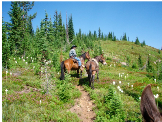
Randy Kappes checks out the scenery on the Montana-Idaho State Line Trail in the Great Burn.

On day four, we packed back down Indian Creek five miles to the West Fork Trail and turned upstream to Foley Basin. The only people we saw on the trip were two Good Samaritan friends on a day ride to bring us cold beer.