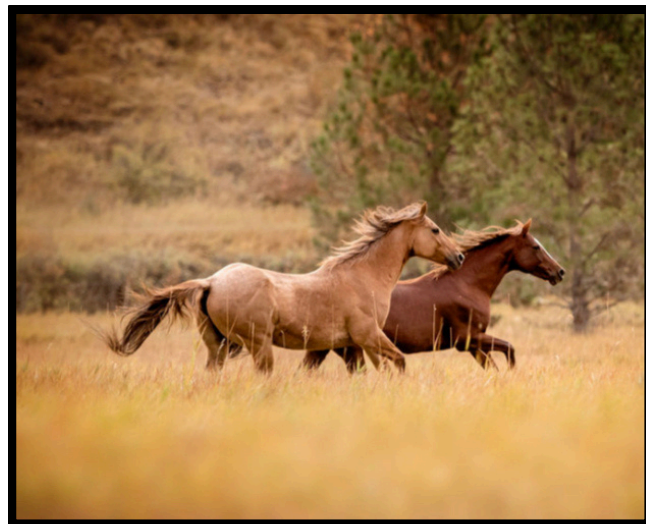
Rio and Bella

I enjoy trail riding and raised my kids in 4-H riding clubs in Utah. We live in Grant Creek on 22 acres. In addition to horses, we have chickens, goats, several dogs and one barn cat. I grow lavender, which I dry and sell locally, and I am an enthusiastic gardener of fruits and vegetables. I also enjoy hiking and cross-country skiing. I joined the Backcountry Horsemen as a way to meet more folks who like to ride. I'm very grateful for the friends and friendships I've gained as a result of this chapter. Thank you for having me as your club secretary.