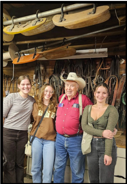
West Pioneers Wilderness Study Area pack trip. Submitted by Dan Harper