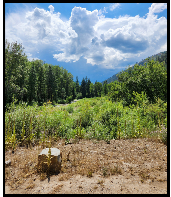
Clearwater Crossing trip, submitted by Rob Braun