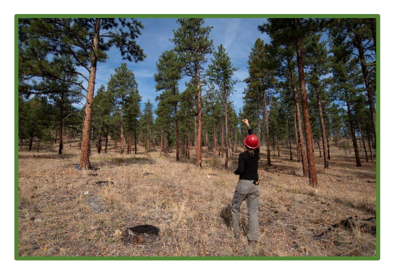
Figure 1.0.6—Assessing lean.