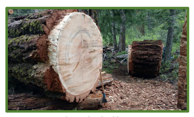
Figure 1.0.4—A large, bucked log.