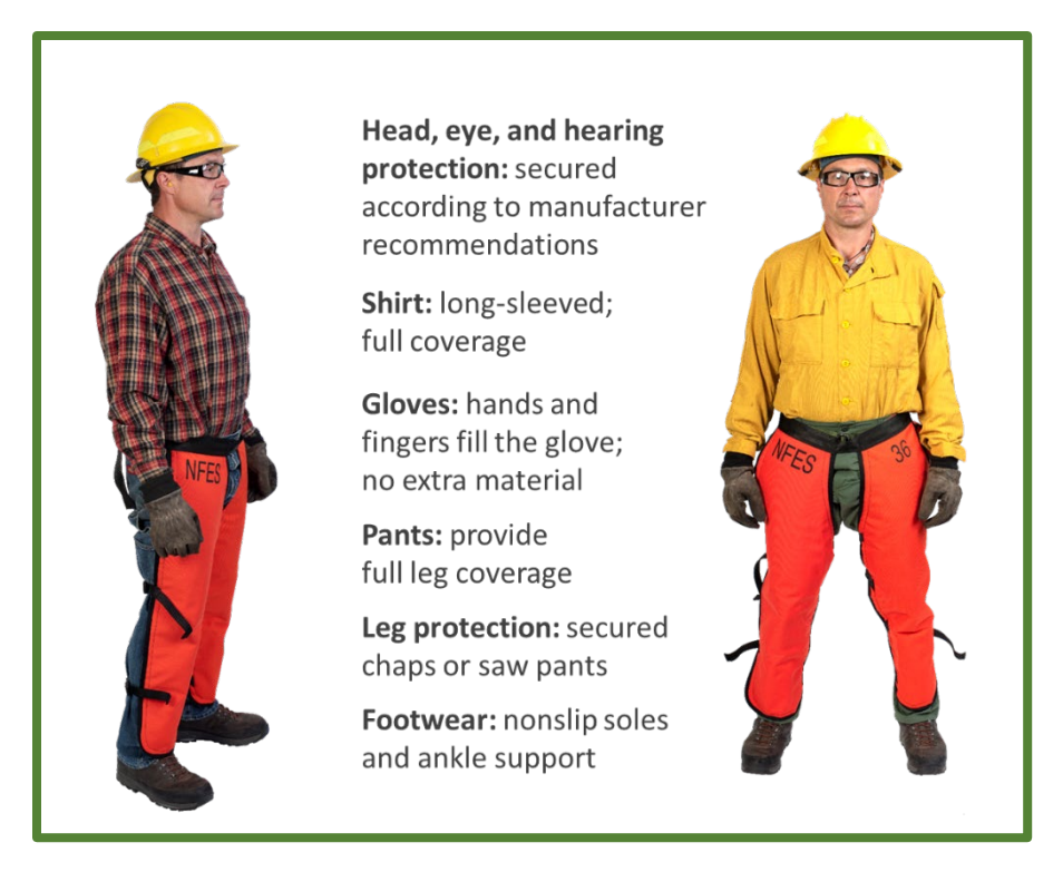
Figure 1.0.2—Ensure that personal protective equipment fits properly.

Module 1: Introduction to Saw Operations