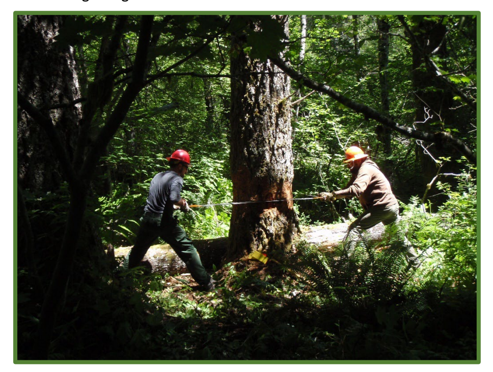
Figure 1.0.8—Sawyers following a cut plan.