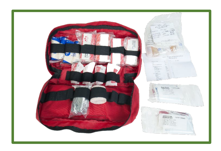
Figure 1.0.3—First aid kit.

Subsection 29 CFR 1910.266(d)(2)(i)—Logging Operations mandates a first aid kit in each employee transport vehicle and at each worksite where employees are cutting trees (e.g., felling, bucking, limbing) (figure 1.0.3).