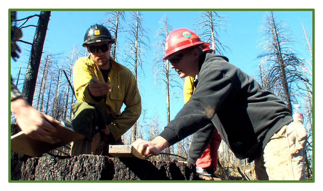
Figure 1.0.1—Sawyers doing a stump analysis.

Sawyer safety comes down to two key concepts: risk management and proper use and fit of PPE.