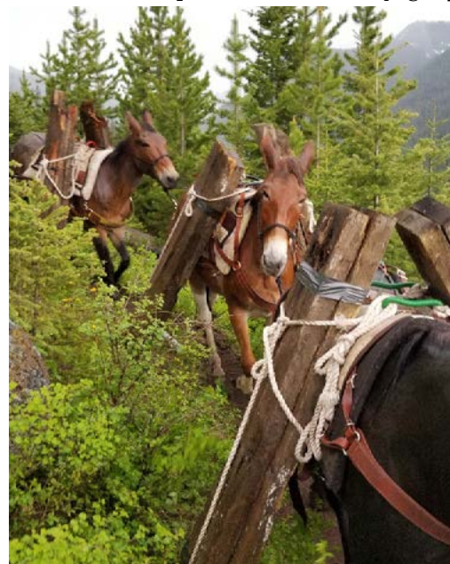
Packing out old puncheons.